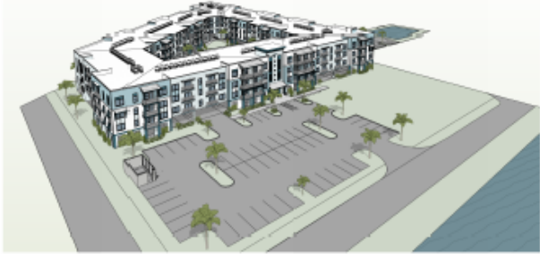
4 NORTHWEST SITE AERIAL