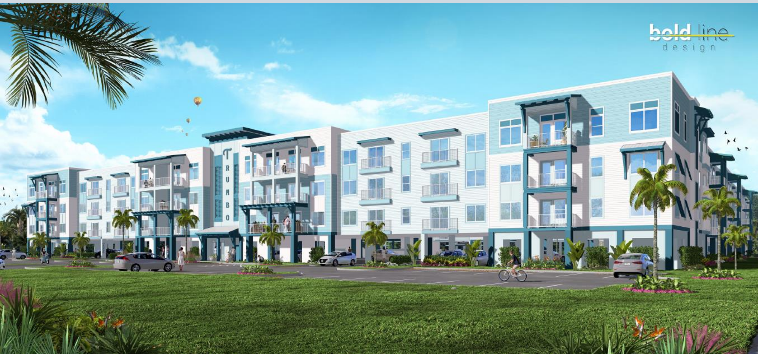
Rendering - view from Trumbo Road