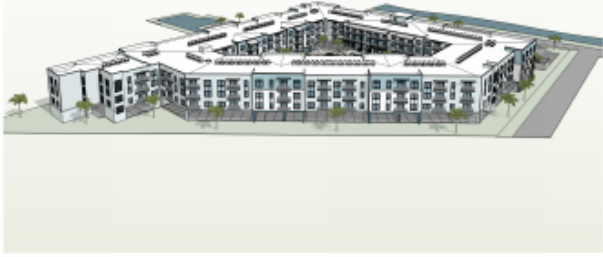
5 NORTHEAST SITE AERIAL