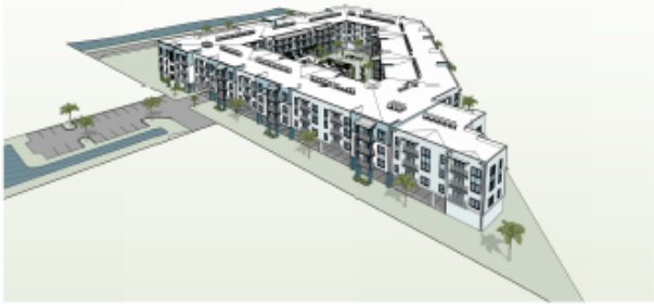
3 SOUTHEAST SITE AERIAL