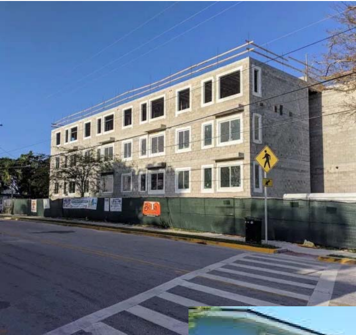
Marty's Place, supported by AH