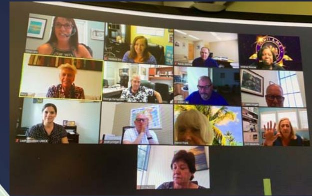
KW COVID RECOVERY TASK FORCE